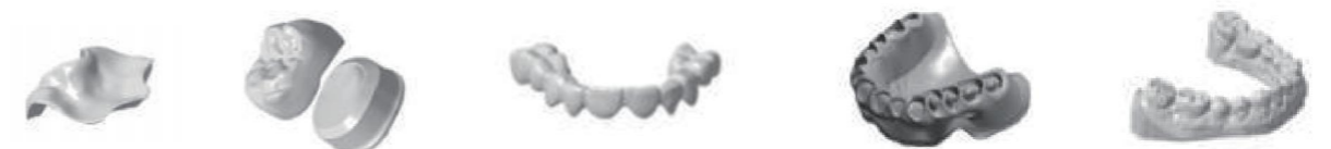
Inlay Telescopic crown Orthodontic braces Complete denture Dental mold

* The above are just a few main products, for more information, please contact us.