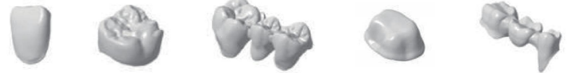
Veneer Full crown Full crown bridge Inner crown Inner crown bridge