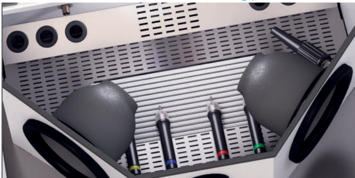
Ergonomically shaped handpieces and a separate air blasting nozzle