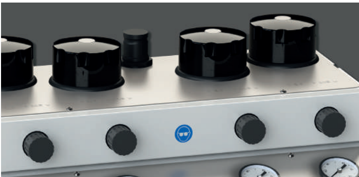
Chambers with individual working pressure, 0.8–6 bar