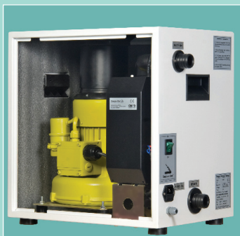
Midi for 1-2 dental unit

Corpus Midi has new model coarse filter (OPTIONAL) for to hold big particulles and inlay and onlay. The filter's installation, maintenance and cleaning are very easy and quickly. Also the filter can be installe to be 90 or 180 degrees.