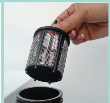
Easily and daily cleaning