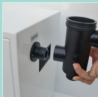
Coarse Filter (Optional)