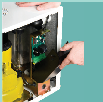
High tech electronic board